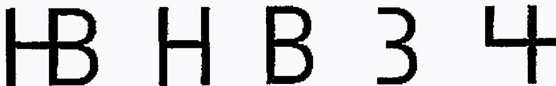
Fig. 2. The HB monogram at the left hand side of the figure is what the subject sees when the image is allowed to slide freely across the retina during normal saccadic eye movements. The H, B, 3 and 4 to the right of the monogram represent the elements that appear as the initial image fades or when there is a brief, slight movement of the image after it has faded

Taken in conjunction with research on fixed images, Bakhurst and Padden's point takes on additional importance. The Russian word, voobrazhenie is made up of three parts: vo (into), obraz (image), and (z)henie (a gerund indicating process). So, literally translated into English, vo-obraz-(z)henie means «into-im-age-making» or